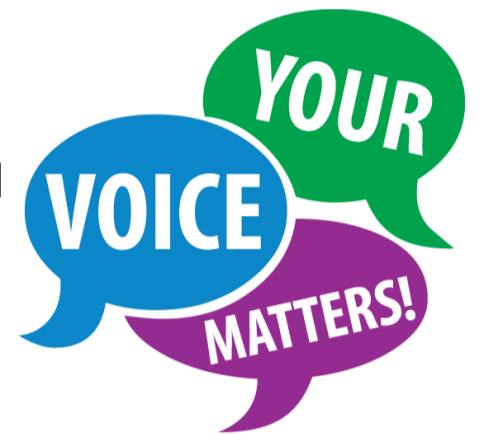
What should the Board's Priorities be for 2023-24?

The Board's Annual Survey 2022-23 was completed by 414 members of the general public and professionals. Thank you to those who completed it. The feedback from each survey has been collated to provide an overall view, illustrated below. The results will help the Board to develop the TSAB Business Plan for 2023-24. Further detailed analysis will be published as part of the Annual Communication and Engagement Report in June.