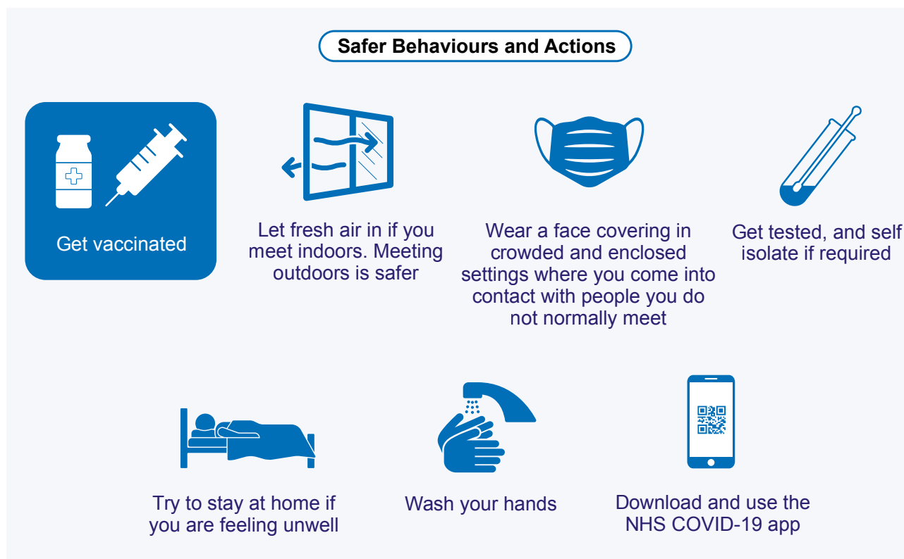
Figure 2: Safer Behaviours and Actions